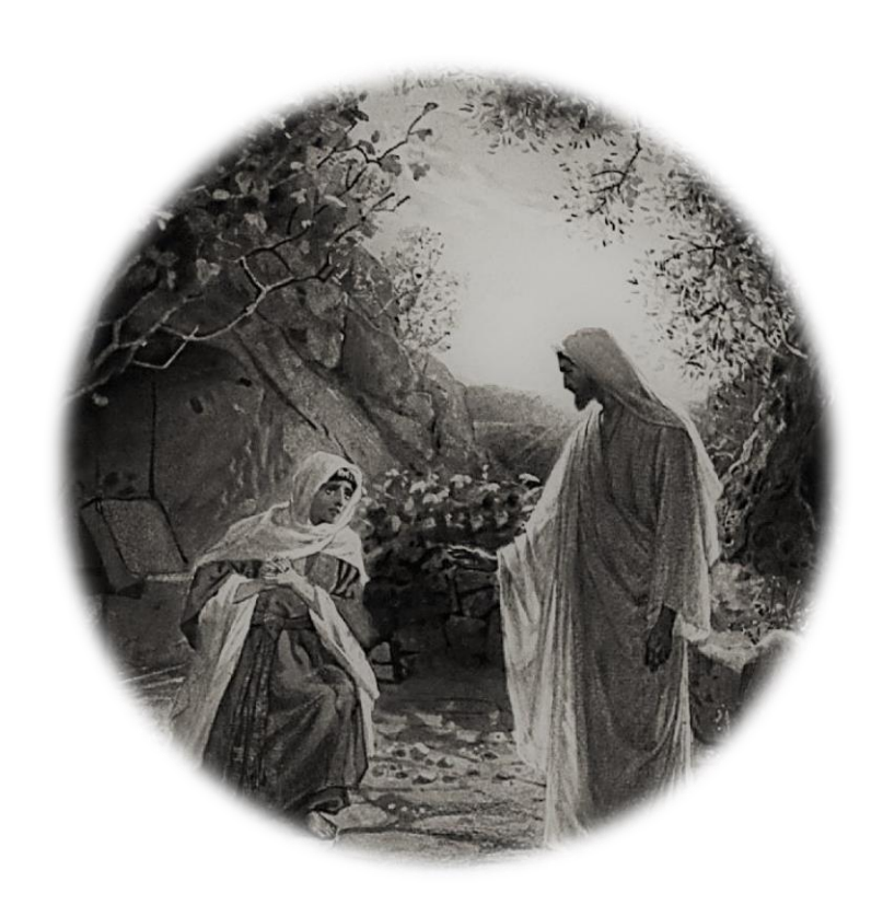
"I am the Resurrection and the Life; whoever believes in Me, even if he dies, will live." John 11:25-26

Words of Remembrance or a Eulogy may be done during the Mass after the Prayer After Communion. A Eulogy may be no longer than 5 minutes and should speak to the faith of the deceased. If possible, it is suggested that a copy of the Words of Remembrance to be done during Mass be emailed or dropped off to the Rectory at least one day in advance before the Funeral. However, it is suggested that the Words of Remembrance/Eulogy be done at the wake service or at the graveside.