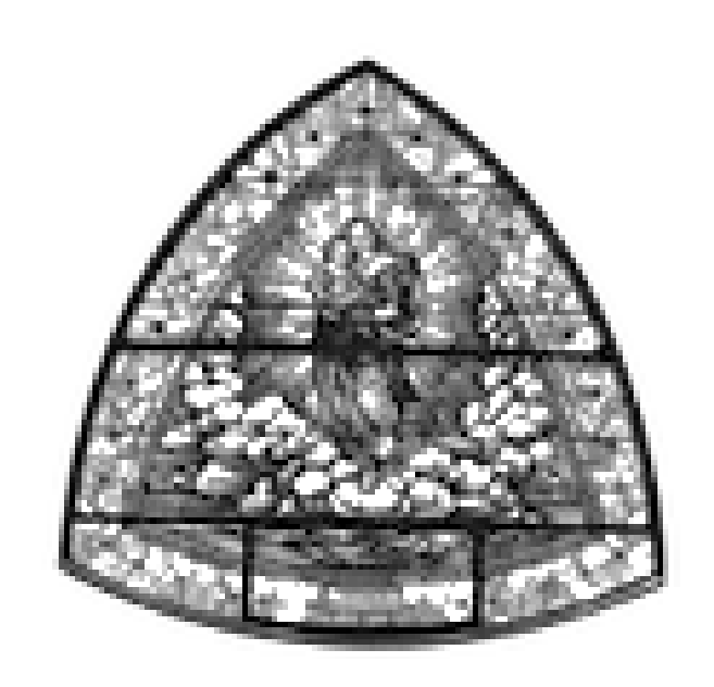
Guidelines for Family Participation in the Order of Christian Funerals Approved Scripture Readings and Texts of the Roman Catholic Church