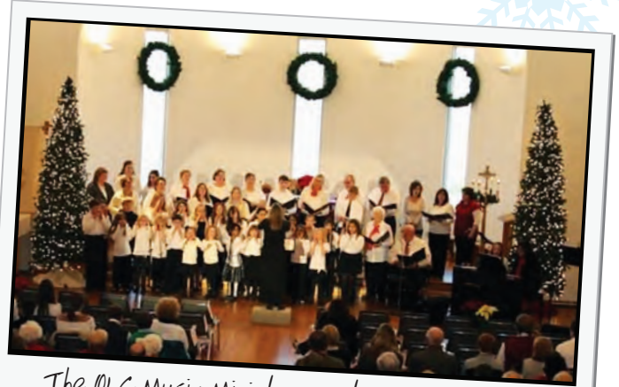
The OLC Music Ministry creates a joyful noise!