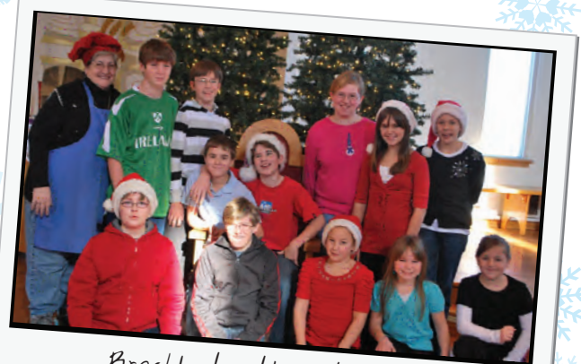
Breakfast with Santa at OLC!