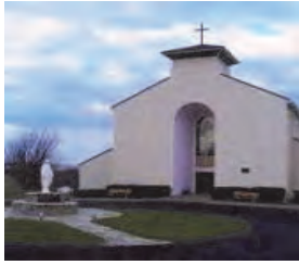
Schneider Parish Center 2995 Cemetery Road Parkesburg, Pa. 19365