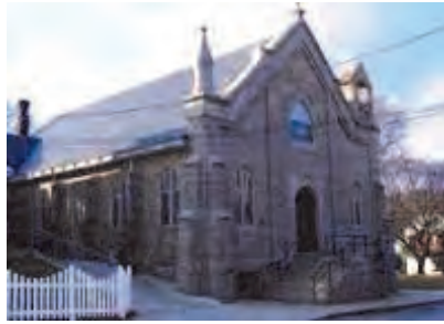
Our Lady of Consolation 2nd Ave. & Chestnut St. Parkesburg, Pa. 19365