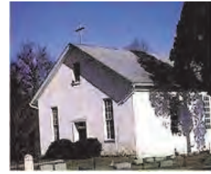
St. Malachy 76 St. Malachy Road Cochranville, Pa. 19330